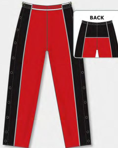
BPC1123 BP500 SERIES