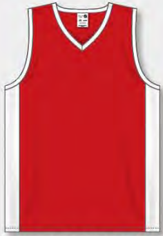
AVAILABLE IN CUSTOM B200 SERIES