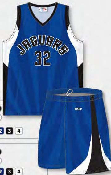
DESIGN B1141 ZB21