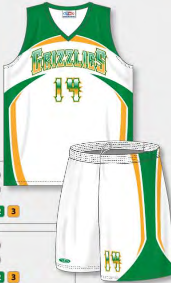
DESIGN B1168 ZB21