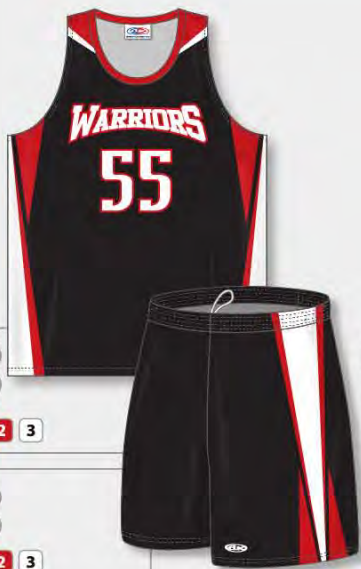
DESIGN B1128 ZB13