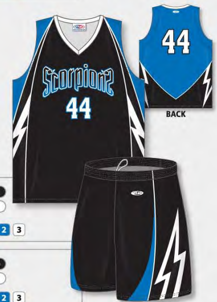
DESIGN B1179 ZB21