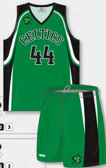
DESIGN B1130 ZB21