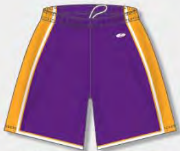
AVAILABLE IN CUSTOM BS300 SERIES