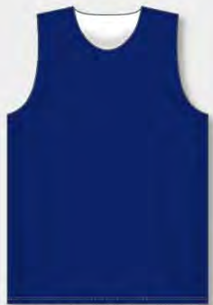
AVAILABLE IN CUSTOM B300 SERIES