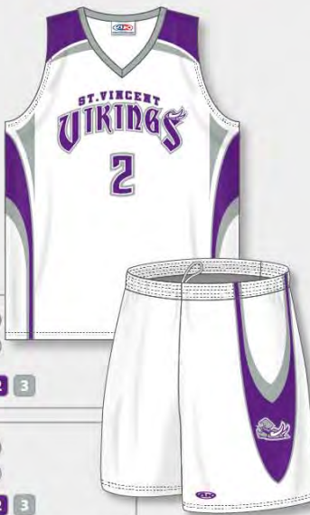
DESIGN B1176 ZB21