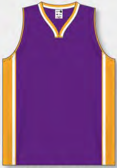
AVAILABLE IN CUSTOM BS500 SERIES