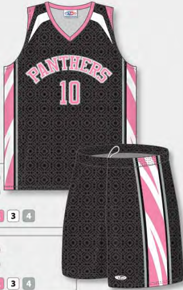
DESIGN B1160 ZB210