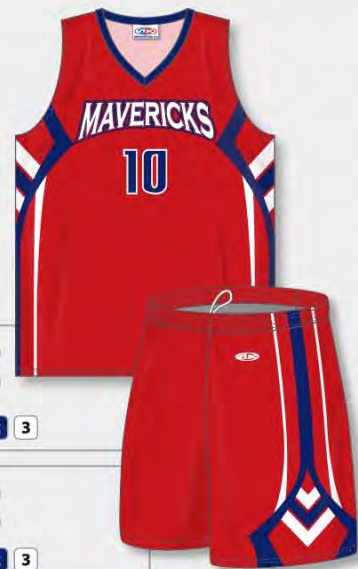
DESIGN B1175 ZB21