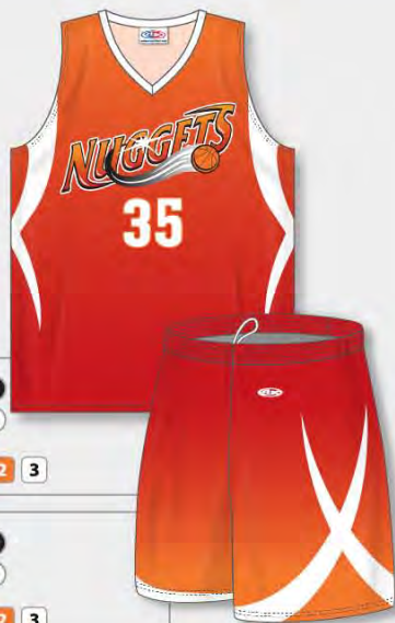
DESIGN B1127 ZB21