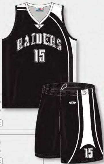
DESIGN B1132 ZB21