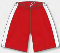
AVAILABLE IN CUSTOM BS200 SERIES