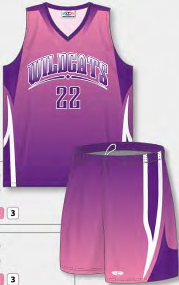
DESIGN B1167 ZB21