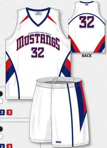
DESIGN B1171 ZB21