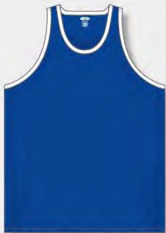
AVAILABLE IN CUSTOM B100 SERIES