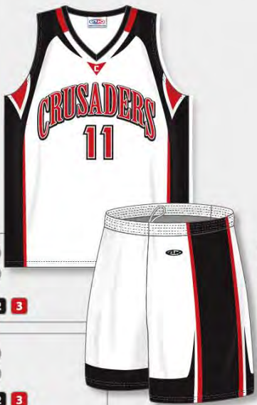
DESIGN B1139 ZB21