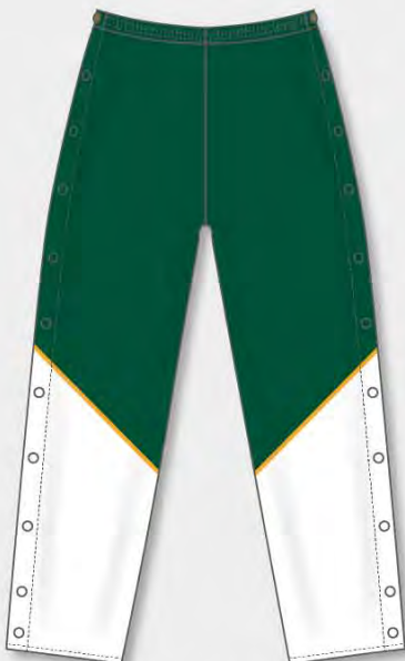
BPC1122 BP400 SERIES