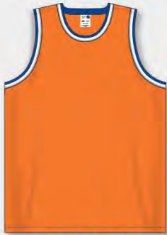
AVAILABLE IN CUSTOM B200 SERIES