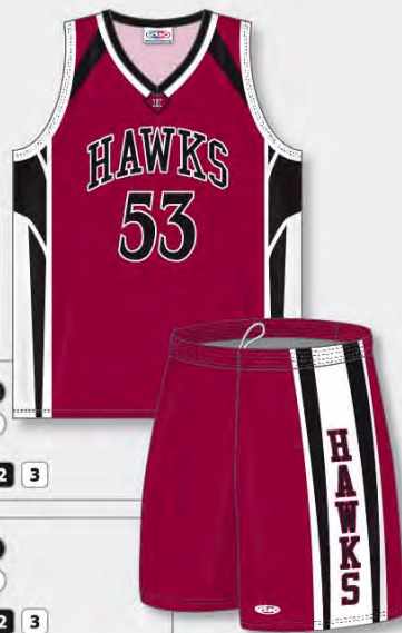
DESIGN B1134 ZB21