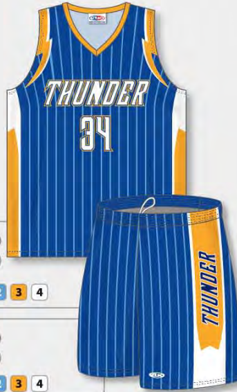
DESIGN B1161 ZB21