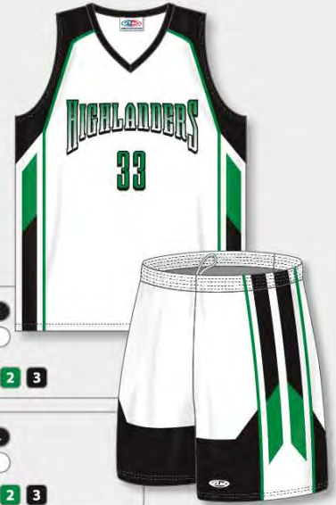
DESIGN B1164 ZB21