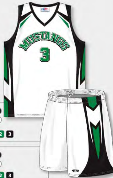
DESIGN B1129 ZB21