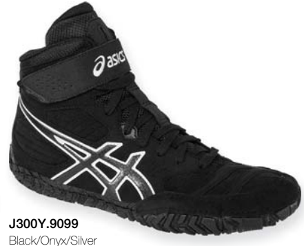
Black/Onyx/Silver (At once)