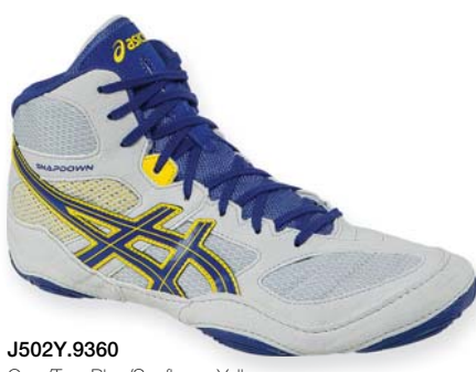
Grey/True Blue/Sunflower Yellow (7/15/15)

Weight*: 8.3 oz. CDN Suggested Retail: $89.99 F0005