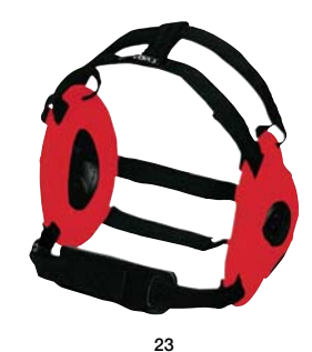
OLD SCHOOL™ zw351 JR. OLD SCHOOL™ ZW451